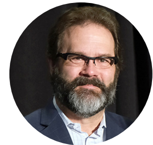
Paul Street Chair